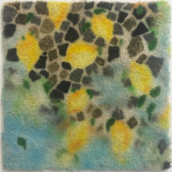
Lemons in Heaven - Suite II to V Airbrushed acrylic on carpet 18" x 18" (each) 2015-2025