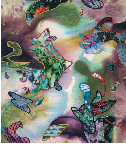
Blooming Veil $3,000 Digitally printed fabric, lace, embroidery and dye on linen 18" x 22" 2020