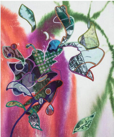
Moribana NFS Digitally printed fabric, embroidery and dye on denim 15" x 17" 2020