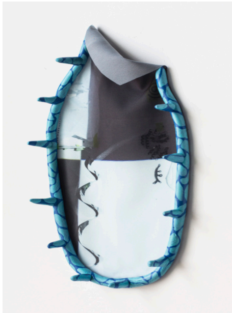
Vessel Resin, paint and printed chiffon 8"x16" 2020