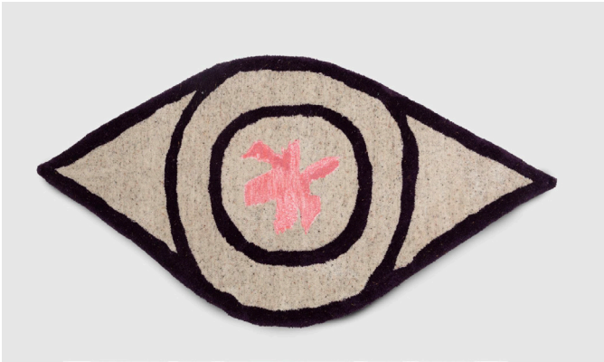
8 Out of 10 Melanoma Acrylic and Wool Yarn 74" x 36" 2022