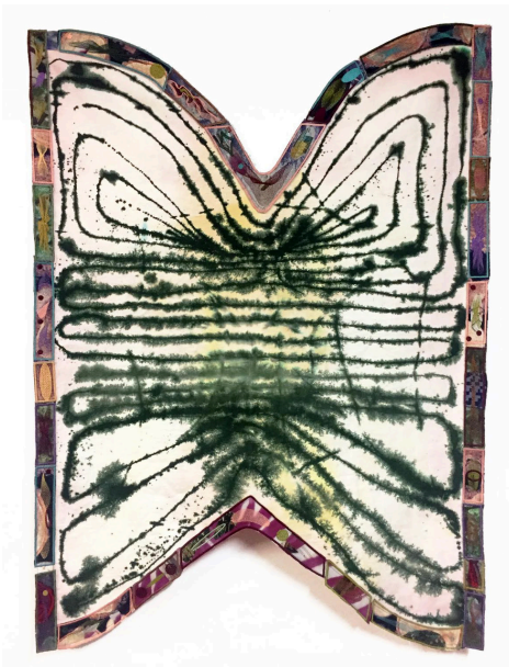
Fossil Flag NFS Dye on denim, embroidery, digitally printed fabric, resin and stone hardware 23" x 29" 2019