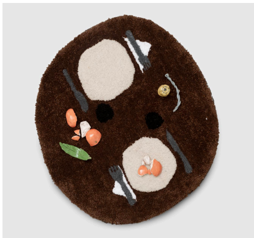
The Grown-Ups' Table Glazed Terracotta & Acrylic Yarn 30" x 30" 2022