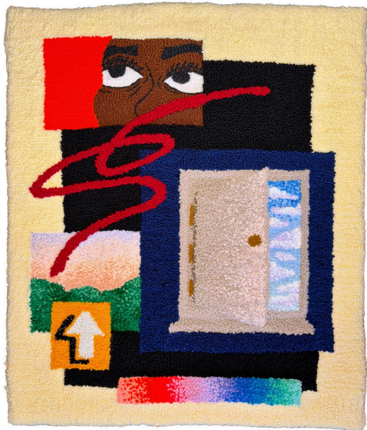
The sun sets on all of us Soon enough Acrylic and wool yarn on monks cloth 26" x 32" 2024