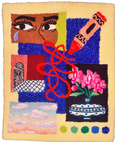
I can still smell that shade of blue when I close my eyes Glass beads, acrylic, and wool yarn on Monks cloth 24"x27" 2024